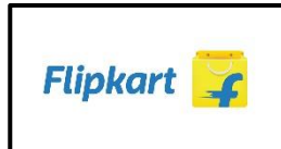
Trainer – Voice and Accent Bengaluru