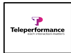
Trainer/Coach – Communication Skills National Capital Region