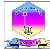
Institute of Hotel Management Chennai Faculty